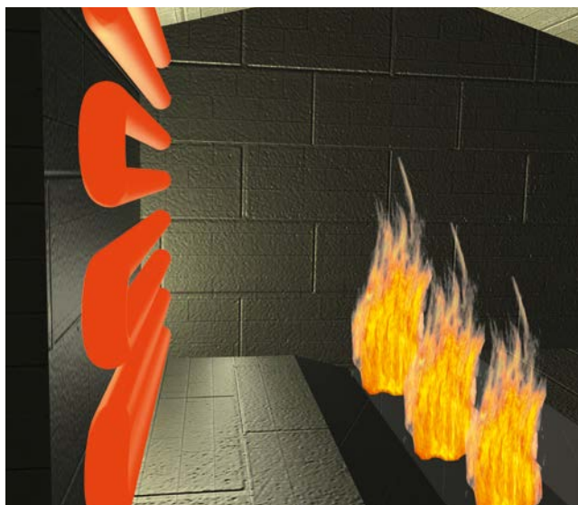
Direct radiation section

The convection heat section is located above the radiant section. In this area the heat is not as intense and the tubes are typically not subjected to direct flame. Here the tubes are typically 150 - 230 mm (6 - 9") apart inside the furnace, which sometimes makes it difficult to attach tubeskin thermocouples. Typically tubeskin thermocouples are only installed on the bottom row (shock tubes).