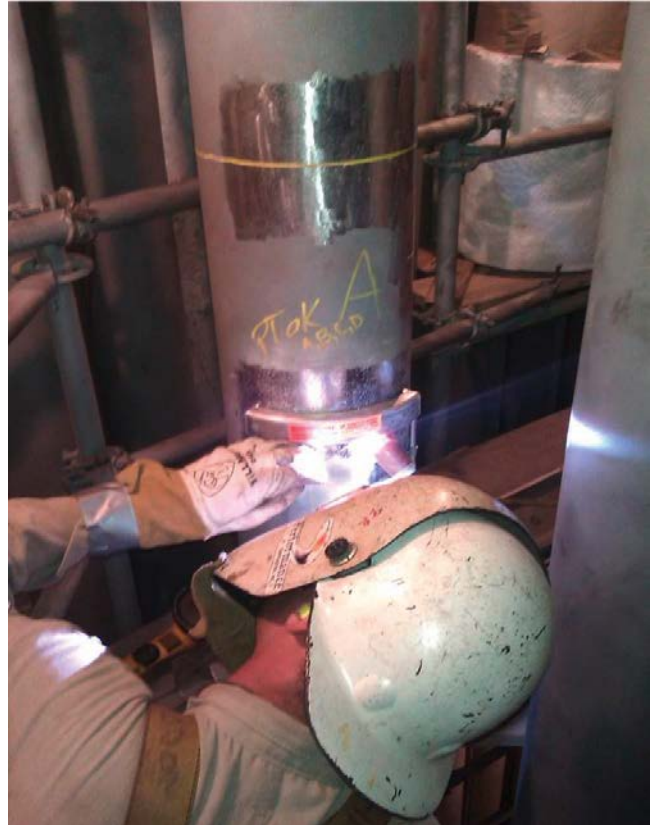
Trained specialist installing sensor

Today, many major refiners, process licensors and furnace manufacturers rely on WIKA/Gayesco services to provide tubeskin thermocouple systems for them. Can we design a system for you?