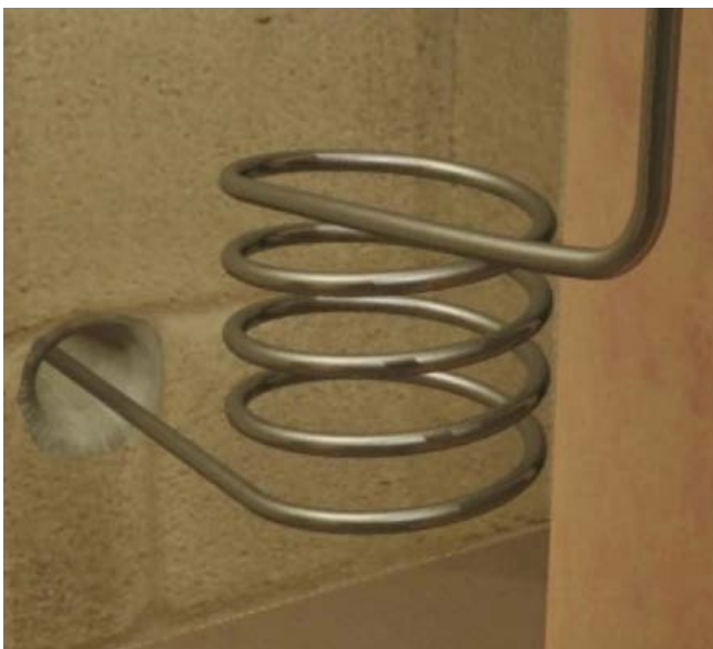
Expansion coils exiting the furnace