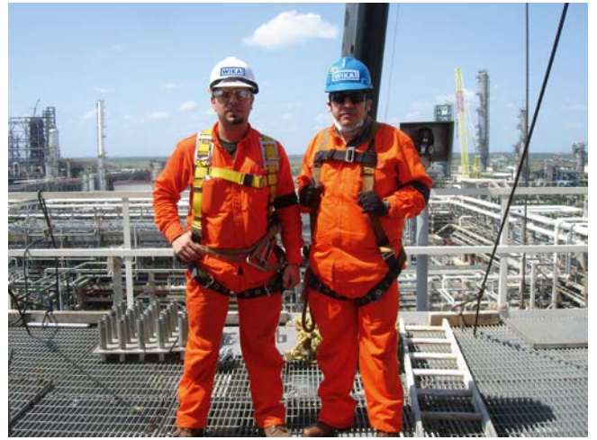
On-site installation crew

With WIKI/Gayesco services you can be sure that you have start-to-finish support. From initial on-site consultation to installation we have a custom-designed solution for you.