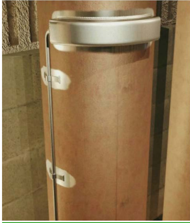
Proper routing with clips