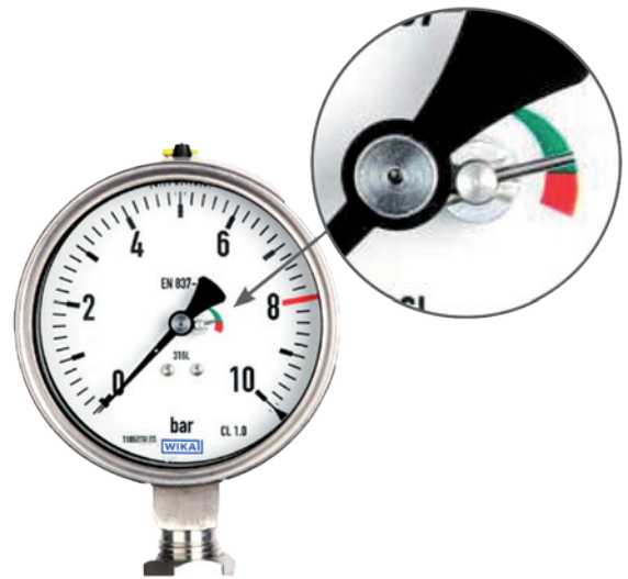
Limit indicator option with enlarged detail